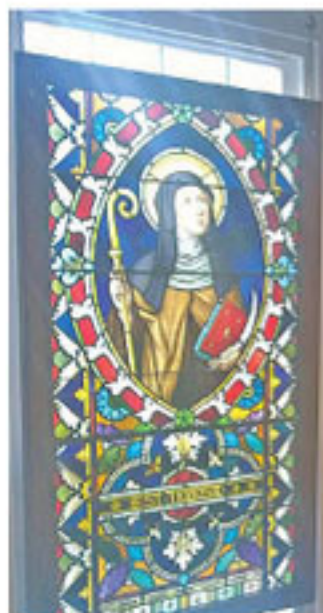
Stained glass window of St. Teresa in the Avila Chapel