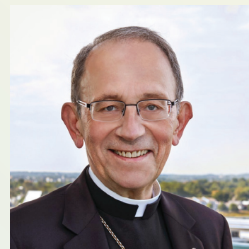
Mass with BISHOP LAWRENCE PERSICO

"BUT I HAVE PRAYED FOR YOU THAT YOUR FAITH MAY NOT FAIL. AND WHEN YOU HAVE TURNED BACK, STRENGTHEN YOUR BROTHERS." LUKE 22:32